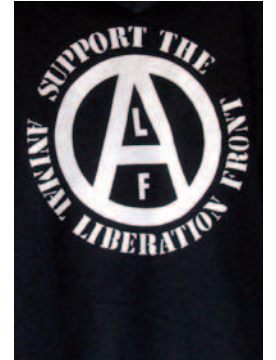
T-shirt - £10 inc postage Hoody - £20 inc postage (sizes S, M, L & XL)