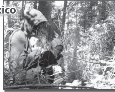
Mexican activists have continued with many actions and liberations, including liberating turtles, 2 lots of rabbits and many caged birds over the past few months.