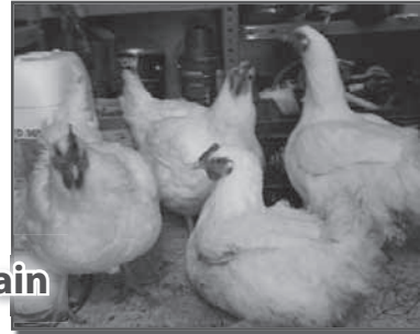
Liberations continue in Spain too with chickens, rabbits and dogs being given loving, life-long homes away from cages and abuse to live out their lives without fear or pain in safety.