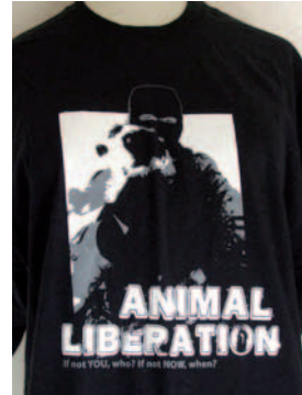
T-shirt - £10 inc postage (sizes S, M, L & XL)