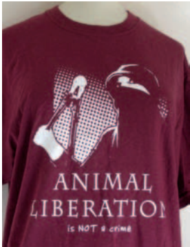
T-shirt - £10 inc postage (sizes S, M, L & XL)