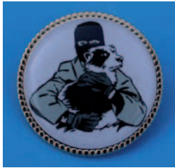
Activist & liberated dog badge - gilt/black/white