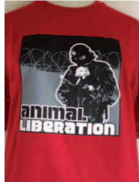
T-shirt - £10 inc postage (sizes S, M, L & XL)