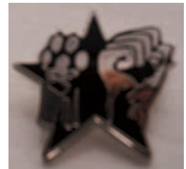
Fist and paw badge in black/chrome

Please complete order form and send it to the address on right >>