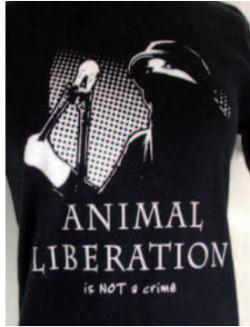
T-shirt - £10 inc postage (sizes S, M, L & XL)