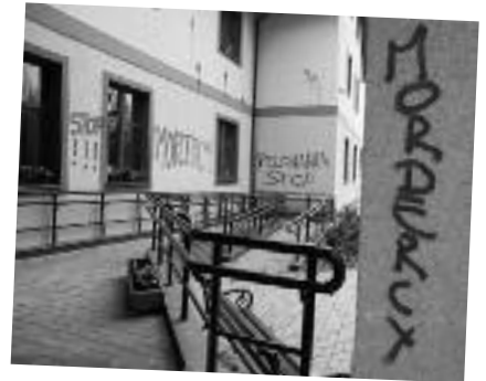
November 13, 2011 - Poland HUNTING ASSOCIATION ATTACKED

November 12, 2011 - UK BOMB SCARE AT HLS CUSTOMER ASTRAZENECA