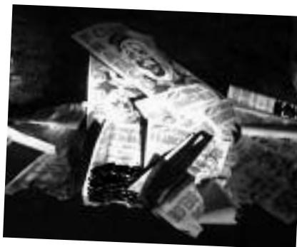
November 12, 2011 France - DOZENS OF CIRCUS POSTERS DESTROYED

November 11, 2011 - Sweden BUTCHER SHOP CLOSSES