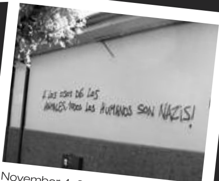
November 4, 2011 - Chile - MEAT COMPANY GRAFFITIED, IN MEMORY OF BARRY HORNE

November 2, 2011 - Germany HUNTING CABINS PUT OUT OF USE