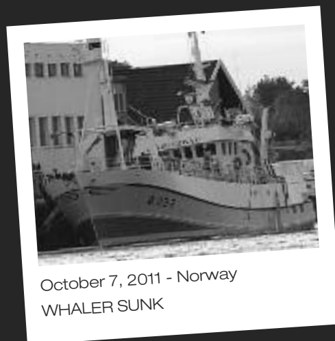
October 7, 2011 - Norway WHALER SUNK

October 10, 2011 - Sweden - WINDOW SHATTERED, TAR THROWN INTO MEAT STORE