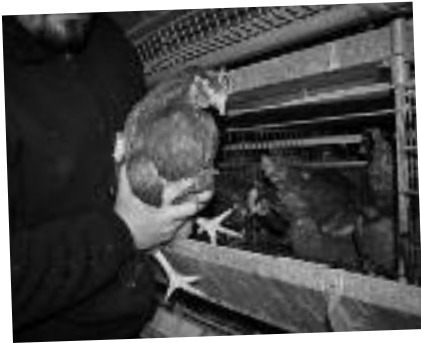
November 3, 2011 - Czech Republic 15 HENS SAFE AFTER OPEN RESCUE

November 2, 2011 - Sweden - MCDONALD'S ADVERTISEMENTS RUINED