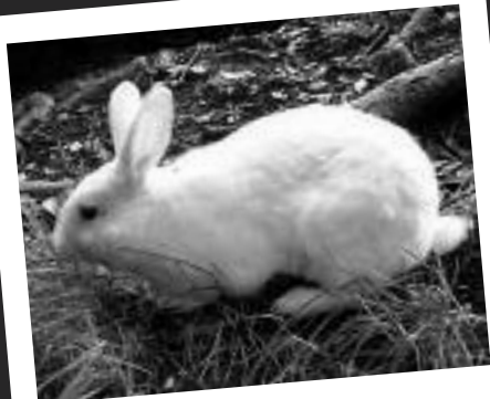
September 22, 2011 Chile - RABBIT LIBERATED

September 21, 2011 - Chile - ALF PAY A RETURN VISIT TO RODEO RING