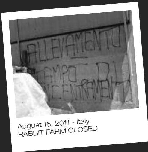
August 15, 2011 - Italy RABBIT FARM CLOSED

September 12, 2011 - Chile RODEO RING BURNED