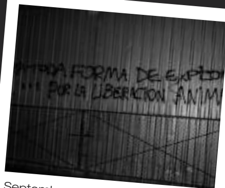
September 30, 2011 - Spain - INSPECTION BECOMES LIBERATION

September 29, 2011 - Sweden THREE HOURS OF GRAFFITI